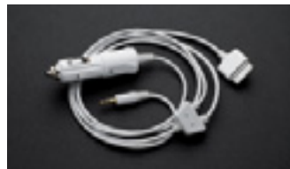
AUDIO CABLE & CAR CHARGER FOR IPOD®^^ Suits all dockable iPods®. Available on selected models where AUX-in option is part of audio unit. Suits iPod® models that have a dock connector