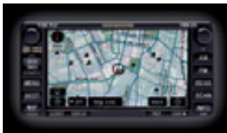
SATELLITE NAVIGATION### AUDIO SYSTEM INCLUDING 4 DISC IN-DASH MP3 COMPATIBLE CD CHANGER WITH BLUETOOTH™†† COMMUNICATIONS & (OPTIONAL) AUDIO INPUT Available on all GLi and GLX models