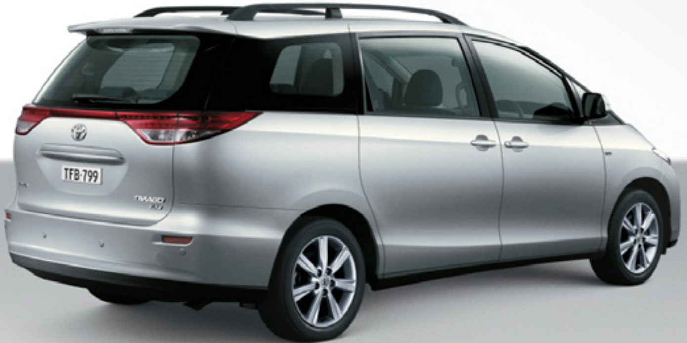
4 cylinder GLX model shown.