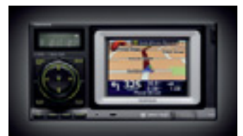
FOLLOWME SOUND & NAVIGATION## SYSTEM INCLUDING SINGLE IN DASH MP3 WITH BLUETOOTH™†† HANDSFREE COMMUNICATIONS, USB IN & (OPTIONAL) IPOD® CONTROL